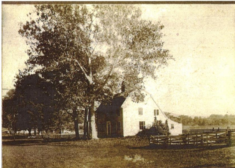
GLEBE HOUSE C1915

THE GLEBE HOUSE MUSEUM & GERTRUDE JEKYLL GARDEN PO BOX 245, 49 HOLLOW ROAD, WOODBURY, CT 06798